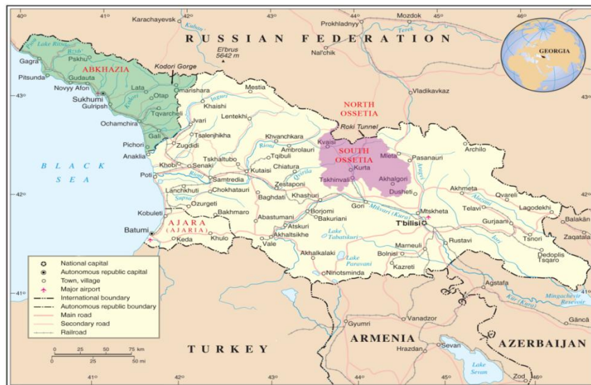
Map 1: Georgian-Ossetian conflict